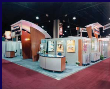
40'x40' Tradeshow Exhibit