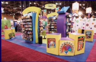
30' x 20' Tradeshow Exhibit