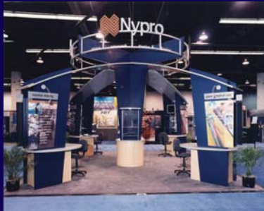
20'x20' Tradeshow Exhibit

Please visit our facility. We are dedicated to meeting or exceeding your expectations.